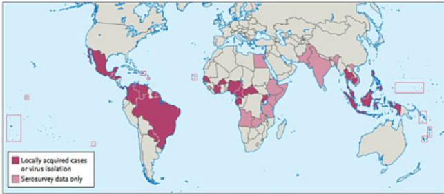
Countries with Past or Current Evidence of Zika Virus Transmission (as of December 2015).